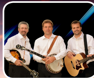
Light of Hope Trio