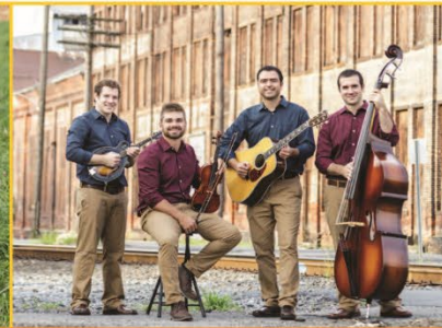
Ransomed Bluegrass Singers