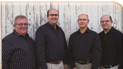
Reaching Out Quartet ~ Acapella

Join us for a Sunday evening Worship with singing & music, testimonies from former inmates and prison chaplains. A visual video presentation will be shared about the ongoing prison ministry effort.