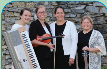
Daughters of Hope