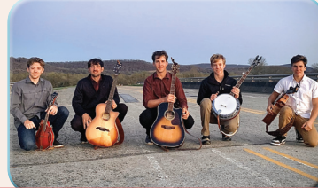
Harmony of Hope