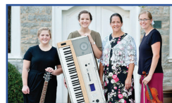
Daughters of Hope