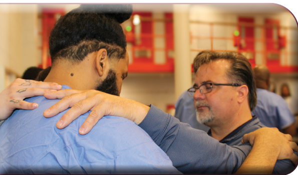
United in Harmony